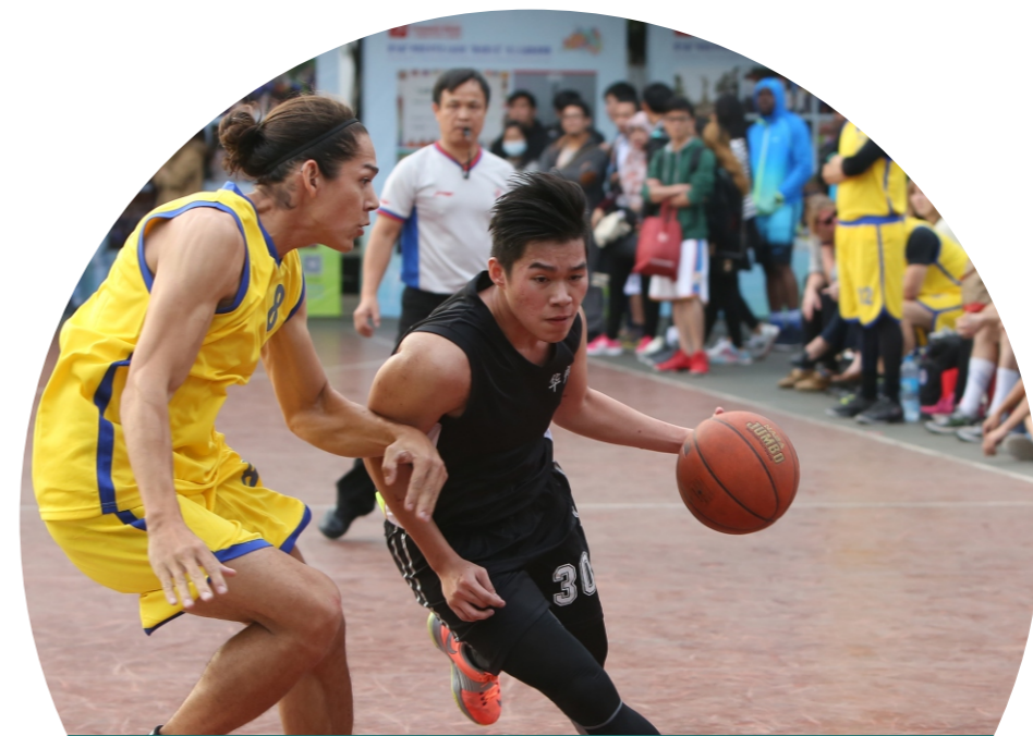
All kinds of ball games (table tennis, badminton, basketball and so on )