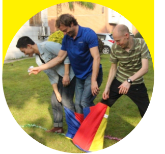
Tug of war