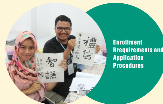
Enrollment Requirements and Application Procedures