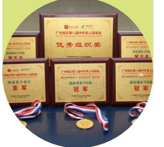
Several competitions held by SCNU, such as dancing competition, Host competition, singing competition and so on.