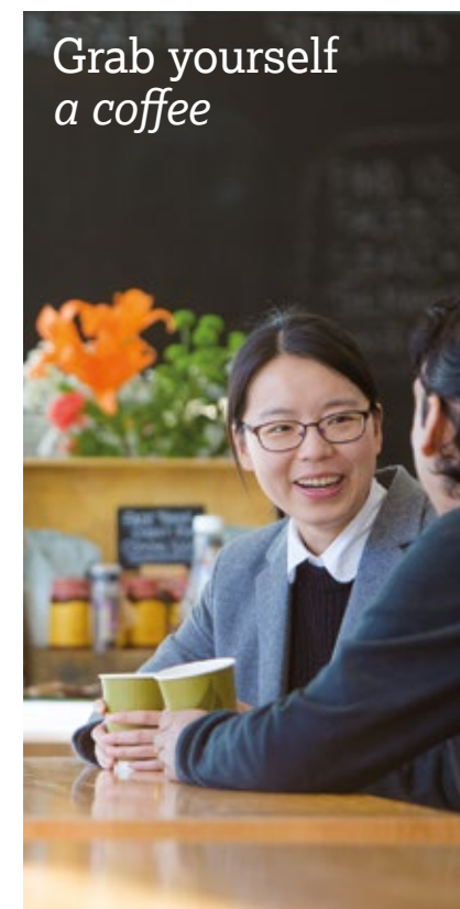
Grab yourself a coffee