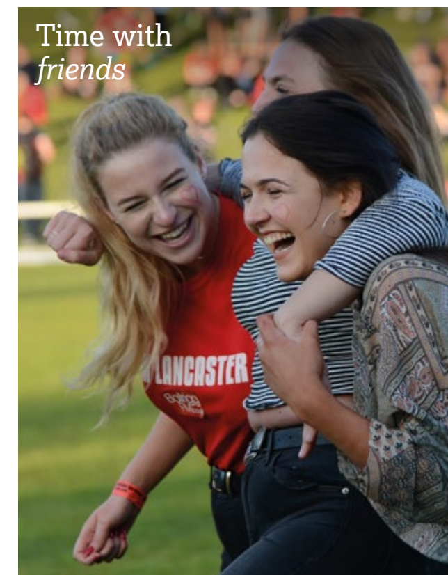
Time with friends